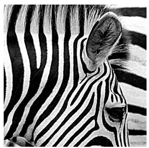
Natasha L, Mood in Stripes , photograph and acrylic collage, 50 x 50 cm, 2011, edition /3

Through her photographs, Natasha L communicates to the public, the emotional load she feels when a wild cat looks straight into her eyes. Until May 24th, will be presented in the frame of the exhibition, a film showing Natasha L, playing fearlessly with a massive untamed tiger. She is then